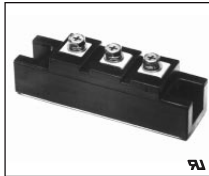
CC410830 Dual Diode POW-R-BLOK™ Modules 30 Amperes/800 Volts